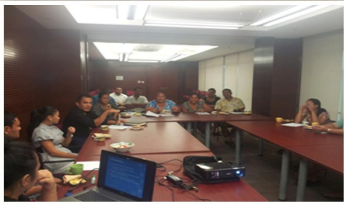
Figure 1: Participants from other division attending the seminar

It is proposed that part two of this seminar focusing on the details of Survey Report Writing will be covered in the next Internal Capacity Building Seminar by LTD for the month of January 2014.